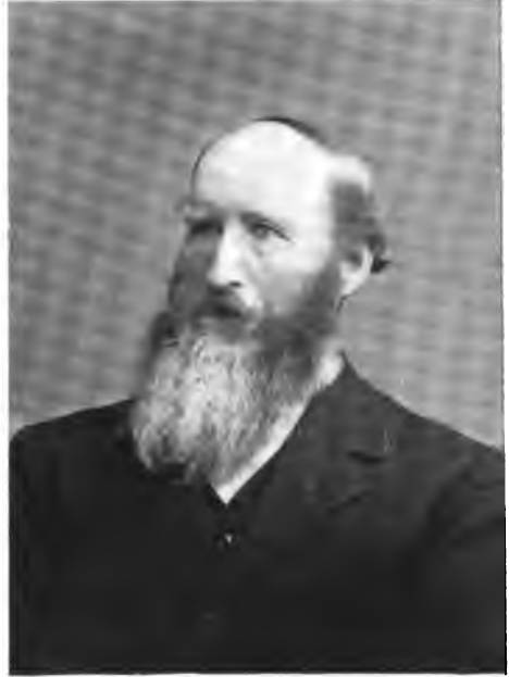
ROSWELL TEMPLE. See page 113. TRUMAN TEMPLE. See page 170.