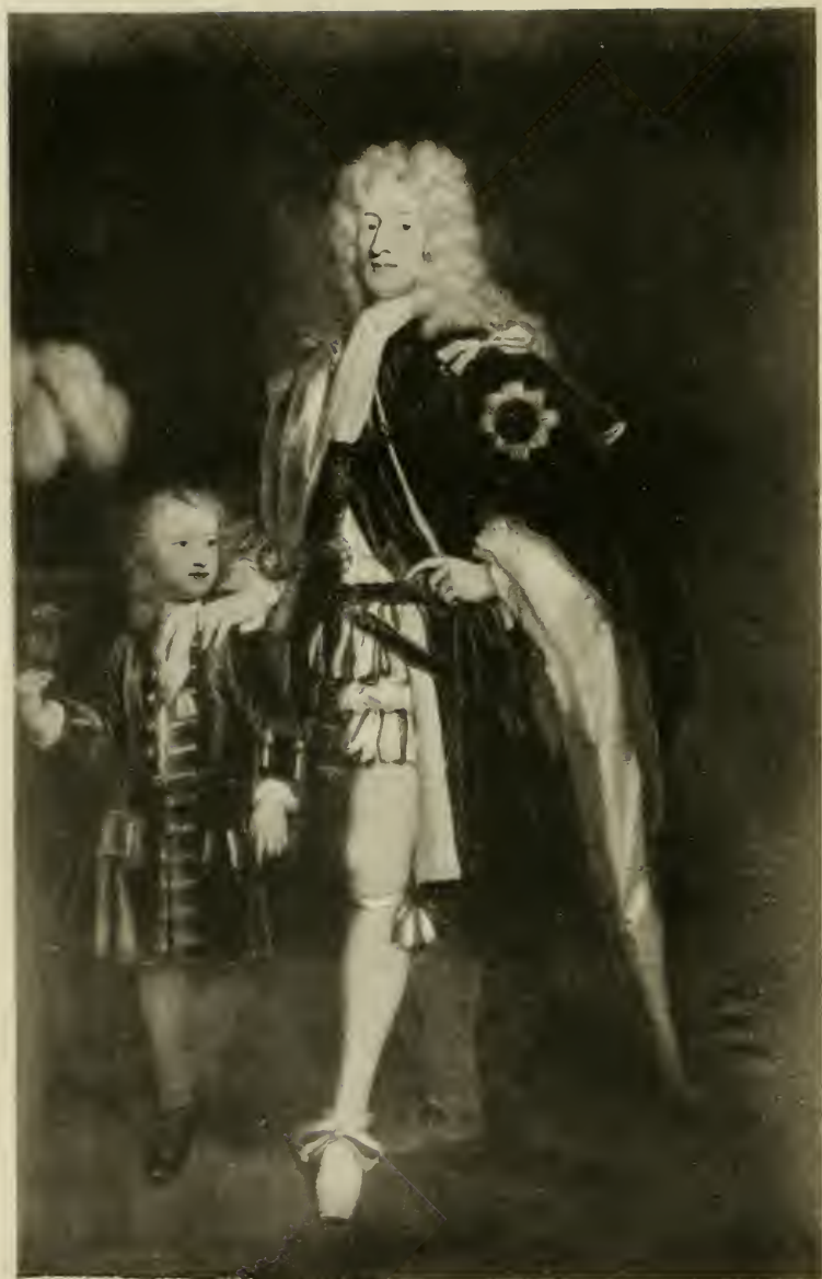
JOHN ERSKINE, ELEVENTH EARL OF MAR, AND HIS SON THOMAS, LORD ERSKINE

from the portrait by Sir Godfrey Kneller in the possession of the Earl of Mar and Kellie