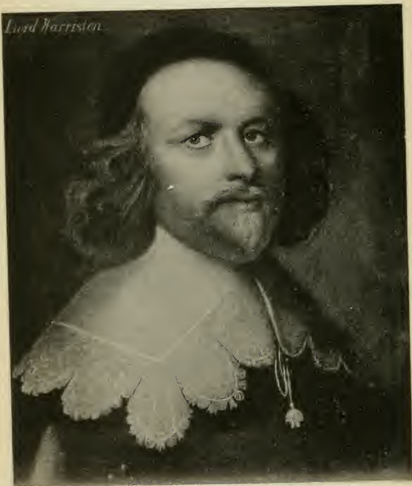
ARCHIBALD JOHNSTON, LORD WARISTON